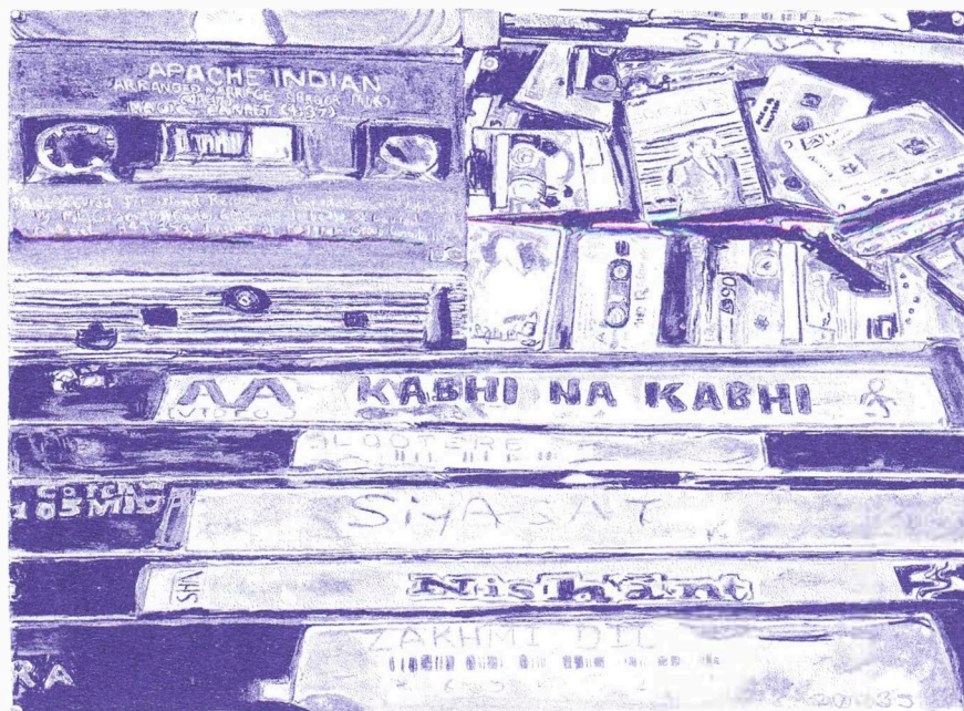
Arora Archive, 2015