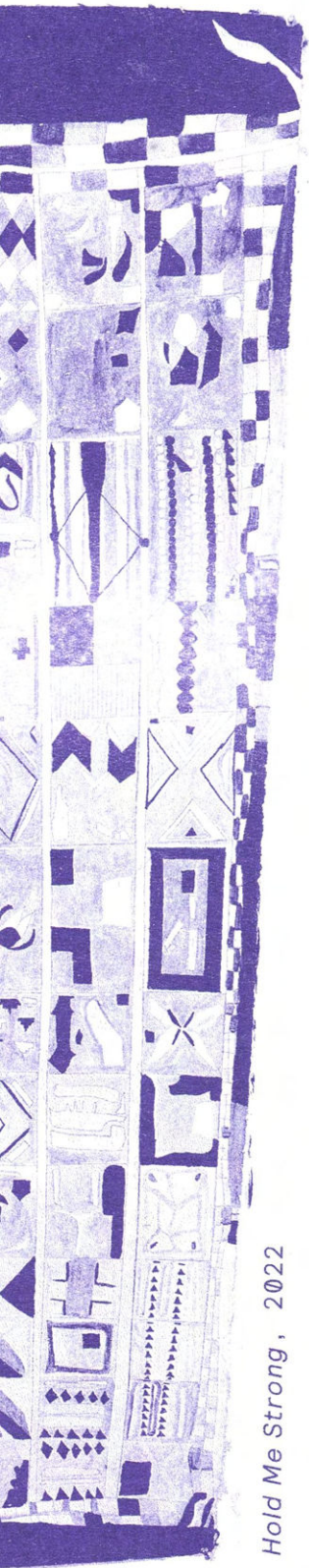
Hold Me Strong, 2022

Every now and then, when we're gathered in the family room at the back of my parent's home, Mom and Dad will share a story from their past—their childhood, their parents and grandparents, of college football matches or riding cycles to school with sisters, or about early days in Canada—and every now and then I record their stories in secret, tapping the record button on my phone. These form my own informal archive of recordings, organized by numbers and dates, but nothing else to indicate the stories embedded within these electronic time signatures. Their storytelling is happy, sometimes infused with longing and nostalgia, but there is almost always a smile or laughter in their recollection.