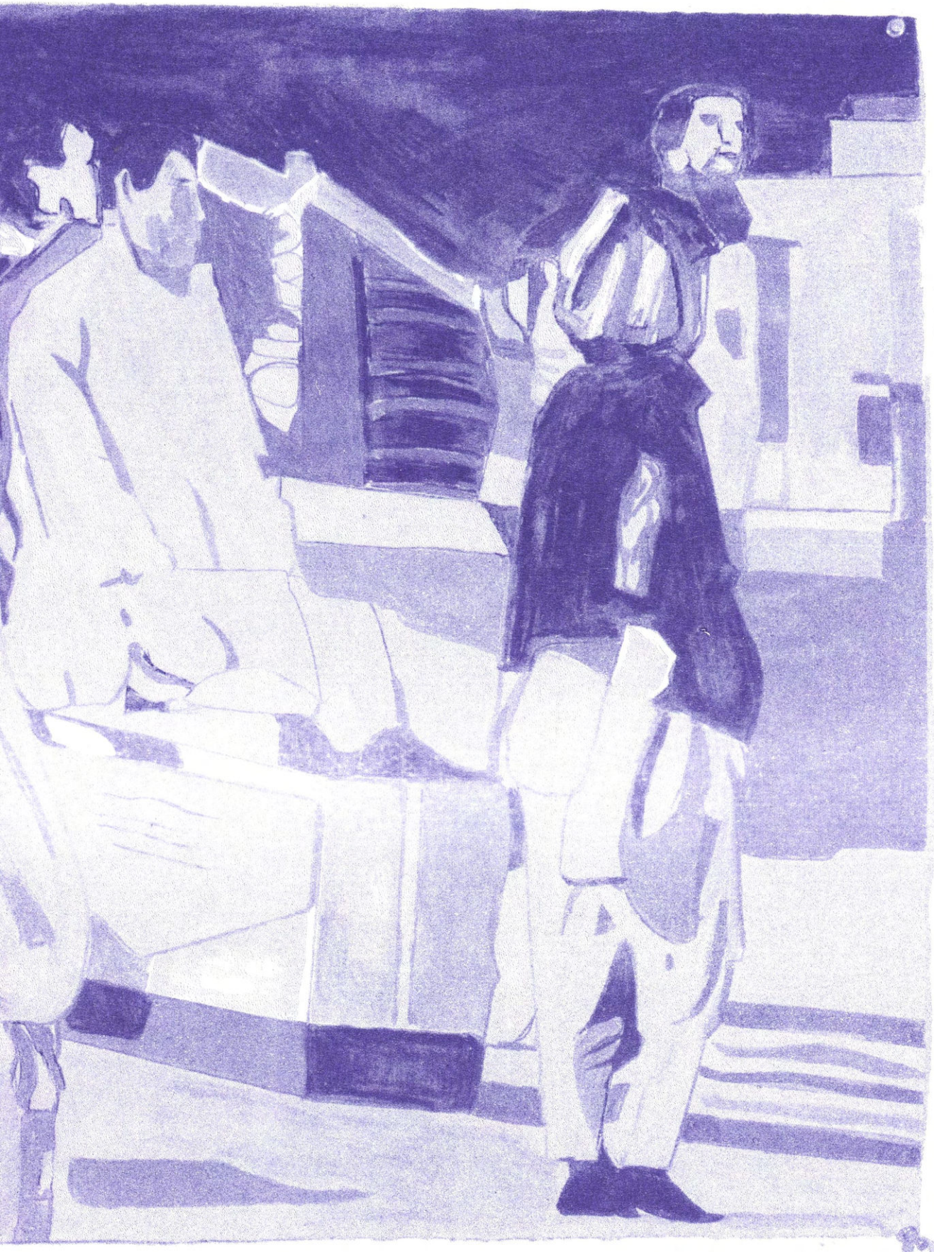
Coming Over Part II, 2017